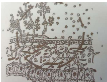
Figure 2. Biological cycle I of Beauveria bassiana . Outside the body (vegetative mycelium, aerial mycelium, conidia, germinal spore, small mycelium). Inside the body (integument, middle intestinal wall, adipose layer, musculature) (Pau, 2000) / Ciclul biologic I al Beauveria bassiana . În afara corpului (miceliu vegetativ, miceliu aerian, conidii, spor germinal, miceliu mic). În interiorul corpului (tegument, peretele intestinal mediu, stratul adipos, musculatură) (Pau, 2000)