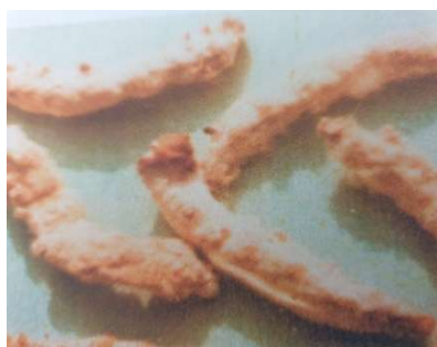
Figure 1. Larvae with clinical signs of muscardine (Pau, 2000) / Larve cu semne clinice de muscardină (Pau, 2000)

Epidemiological investigation based on laboratory diagnosis is an essential component of efforts to prevent and control mycotic diseases in silkworms and can significantly contribute to maintaining the health and productivity of silkworm populations (Figure 1, 2, 3). By using modern techniques and appropriate equipment, laboratories can provide important information for managing the health and productivity of silkworm populations, thereby helping to maintain the sustainability of the sericulture industry (18).